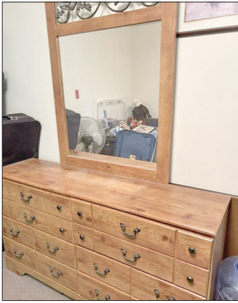
For Sale: Full Size 6 drawer dresser with full size mirror. $200. 304-851-1625.